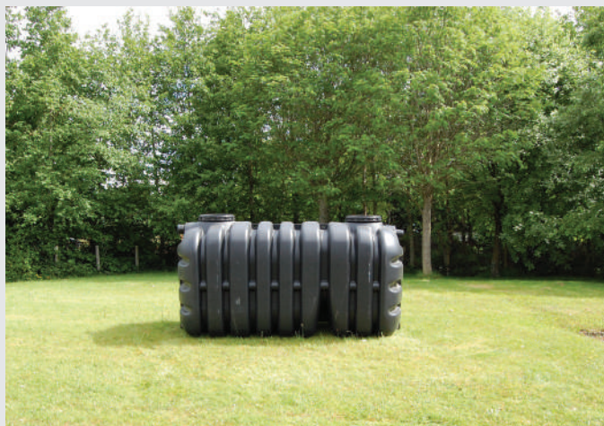
Lightweight and easy to handle.