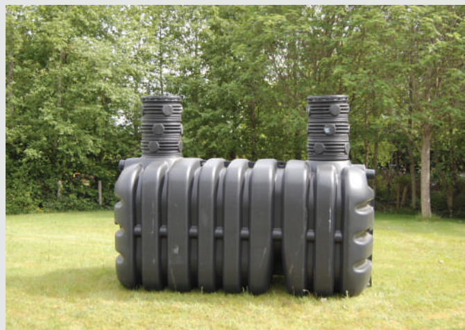
Tricel Vento with risers.