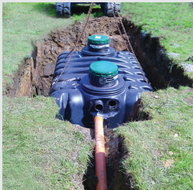
Tricel Vento installed.