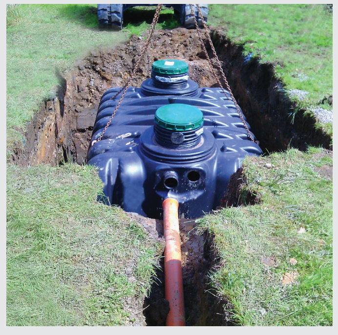
Tricel Vento installed.