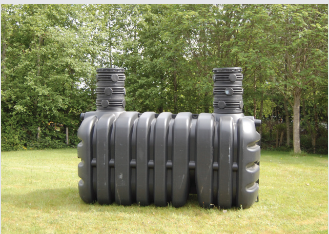
Tricel Vento with risers.