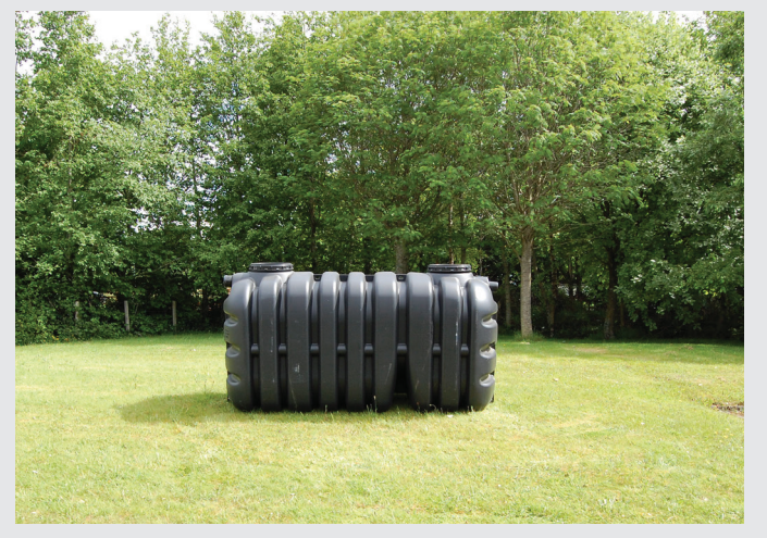
Lightweight and easy to handle.