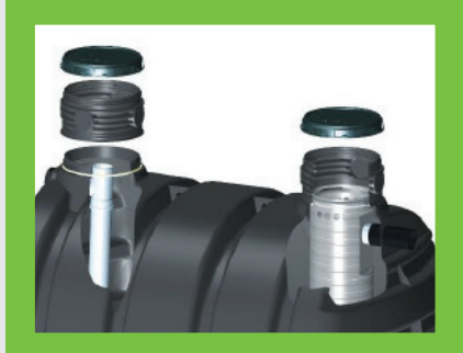
If flexible invert levels are necessary, risers are available for deeper installation requirements and sold separately. When risers are in use, they are necessary on both the inlet and outlet sides of the Vento septic tank. Each riser is 180mm high and can be used to a maximum height of three risers.